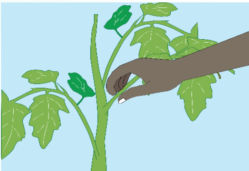
Remove the lower leaves